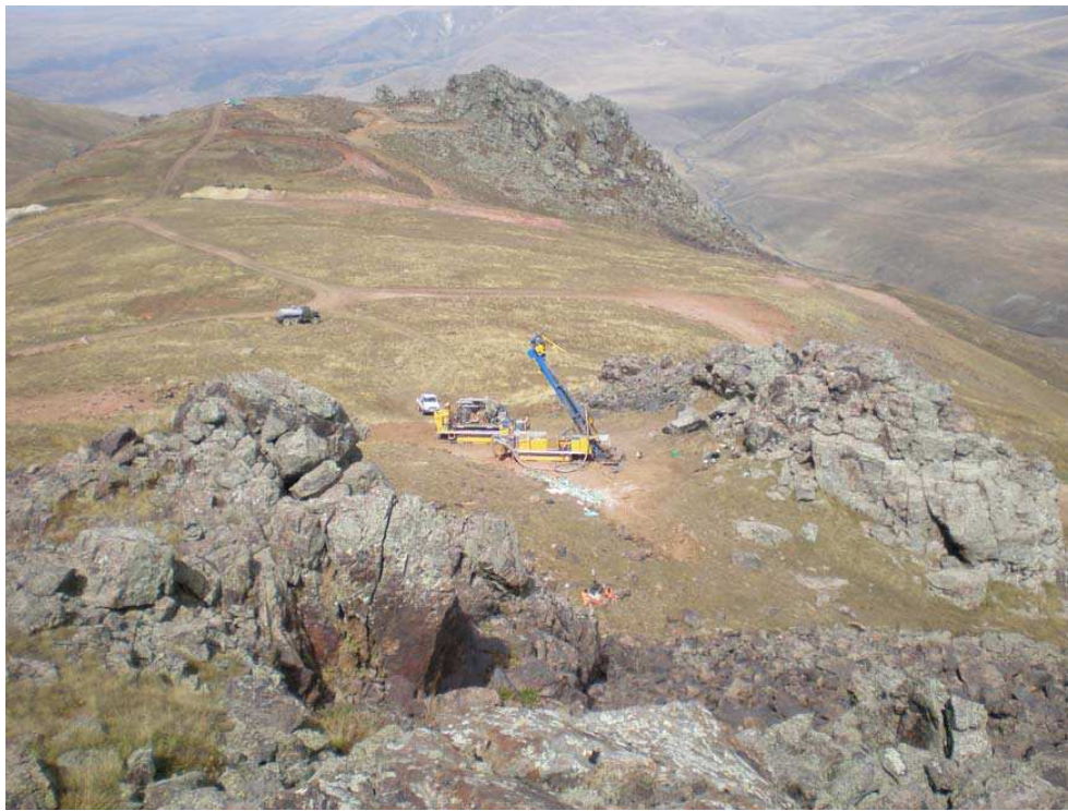
2008 drilling at Artavasdes with Tigranes in background.