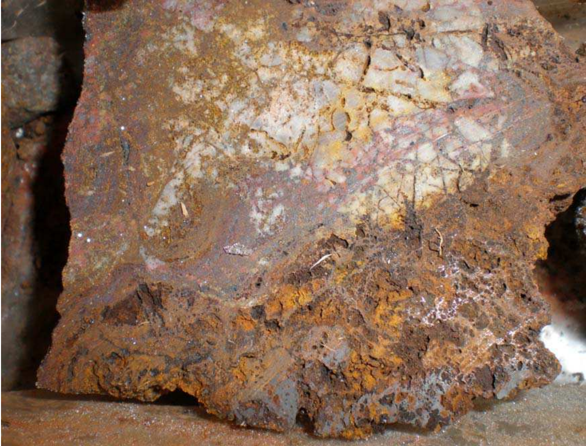
Quartz-alunite-earthy iron oxide-gold sample from Amulsar.

Amulsar was literally found by Lydian geologists including CEO Tim Coughlin in 2005 “while driving past it going somewhere else”. They immediately recognized it as a high sulfidation alteration zone. In 2006, reconnaissance rock samples returned up to 18 g/t Au along the central ridge line. Subsequent soil samples identified an area of 3.5 by 0.5 km exceeding 0.1 g/t Au, more than 21% of grab rock-chip samples assayed greater than 1 g/t Au, and trench samples returned 128 meters at 1.3 g/t Au.