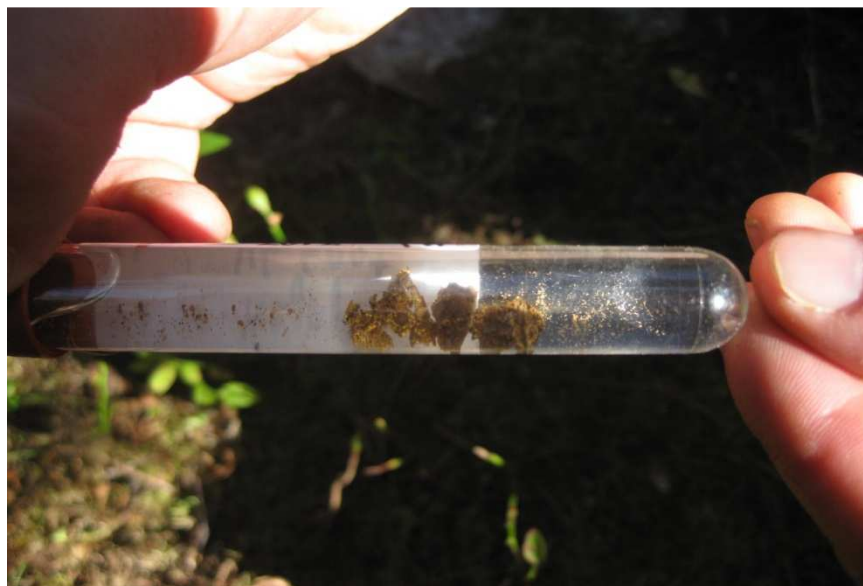
Coarse Crystalline Gold from Rajapalot

And this is the product of Tuomas' efforts, panned from material in the hole: